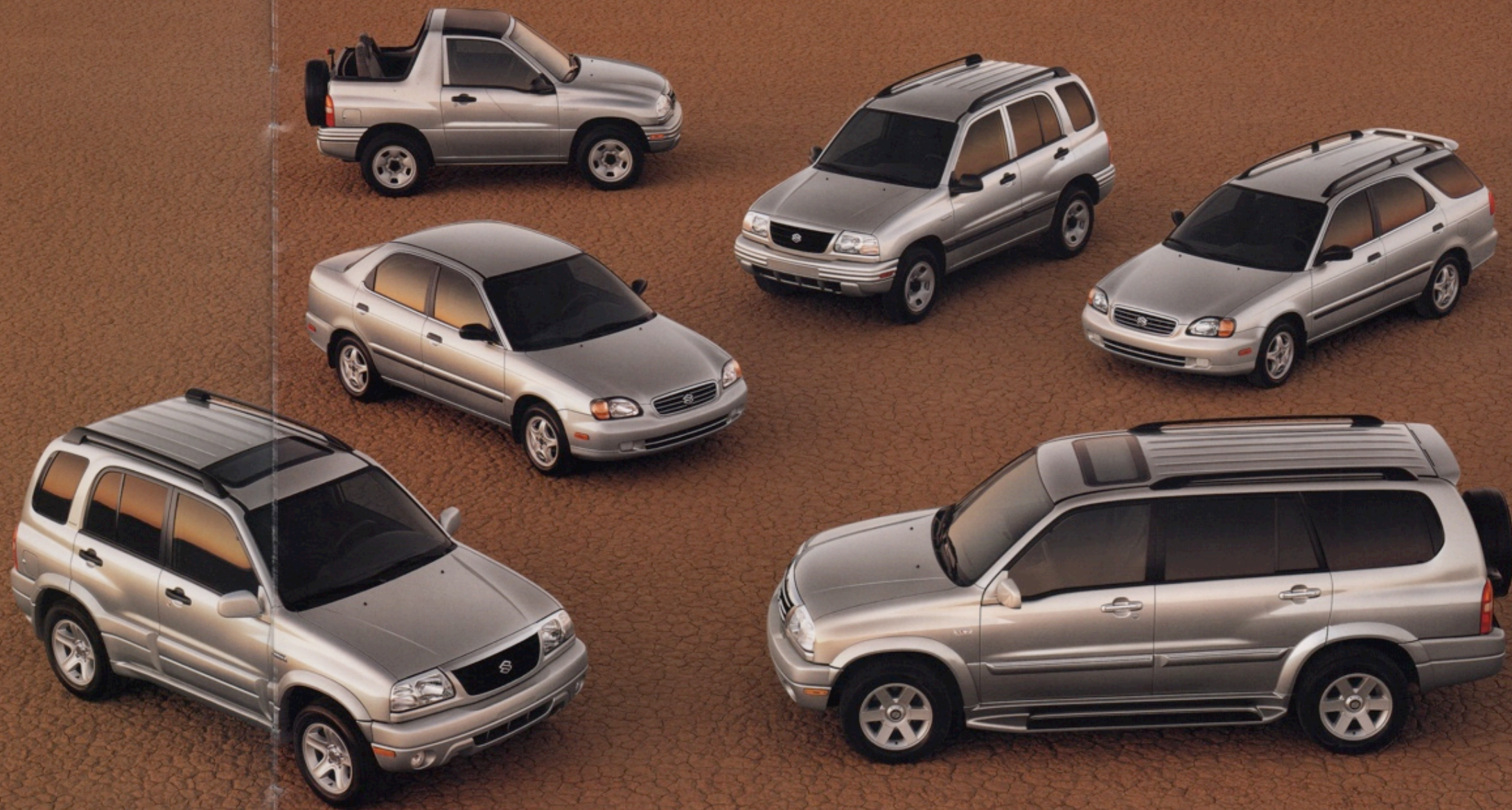
2002 Suzuki lineup. Clockwise from bottom left: Grand Vitara, Esteem Sedan, Vitara 2-Door, Vitara 4-Door, Esteem Wagon and XL-7.